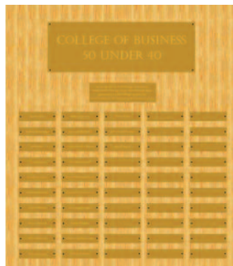
50 Under 40 Plaque